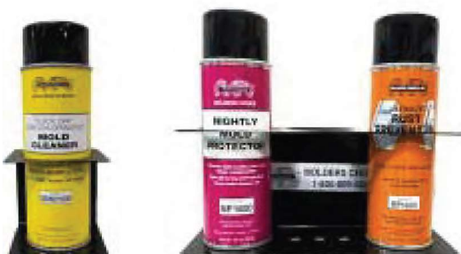
Three sizes – 1, 3 or 6 cans